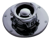
#5 Sink Flange Mounting Assembly