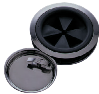
#7 Collar Adaptor with Splash Baffle and Stopper